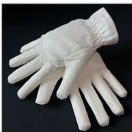
Dust-free protective gloves