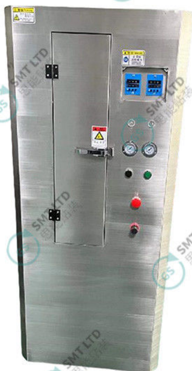
Full pneumatic steel mesh cleaning machine