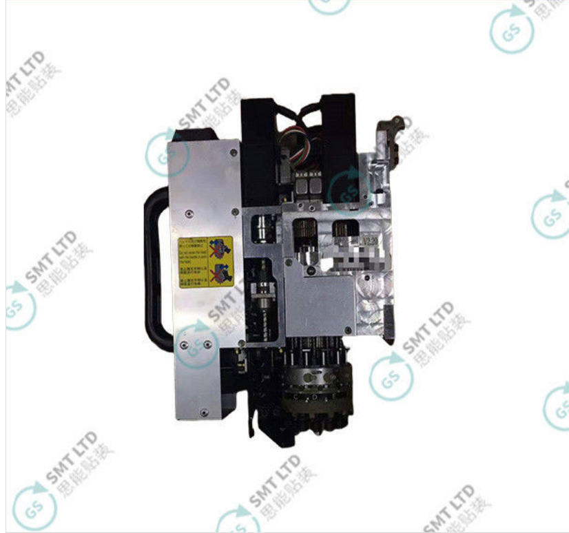
Fuji Placement Head Series Product Images