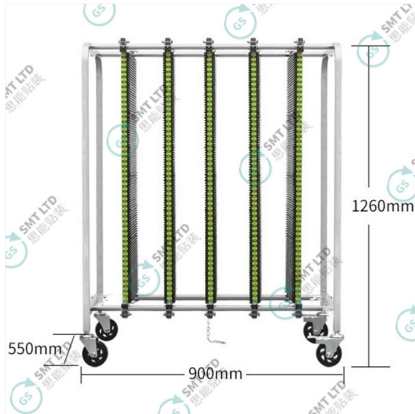
400pc Capacity ESD PCB Storage Trolley